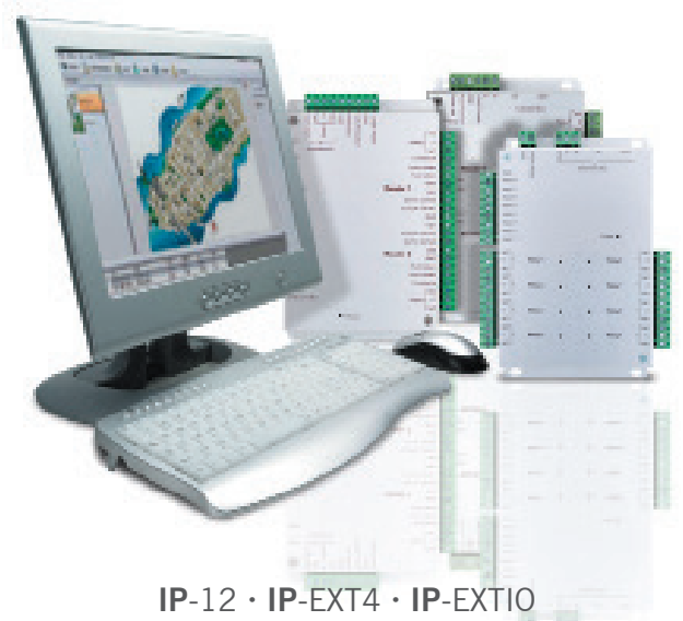
IP-12 · IP-EXT4 · IP-EXT10

Our ON-LINE access control switchboard can be enlarged with the connection of expansion modules and managed by the DOMOS software using TCP/IP.